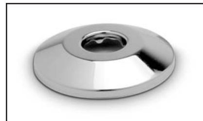
STYLE 65 ONE-PIECE ESCUTCHEON