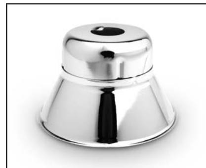
STYLE 401 TWO-PIECE ESCUTCHEON